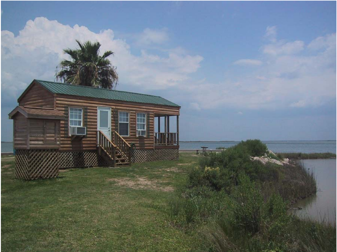
San Luis Pass County Park: Cabin 3 and 4 (pictured below) were constructed in 2006 and are ideal for fishing. They are located right off of the bulkhead in the main fishing channel.