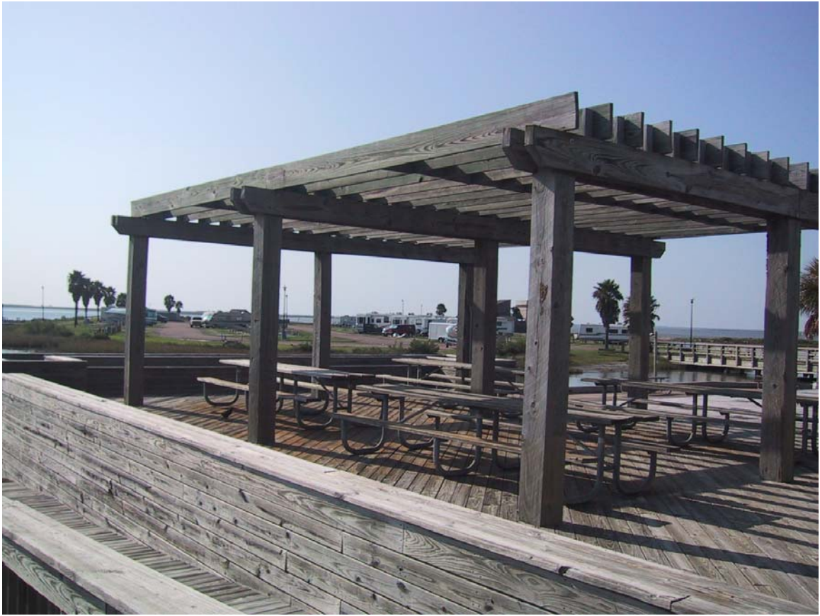
San Luis Pass County Park: Above - The Marlin Pavilion can accommodate up to 70 visitors. Below - Cabins 1 and 2 are ideal for families with children since it is located near the playground area.