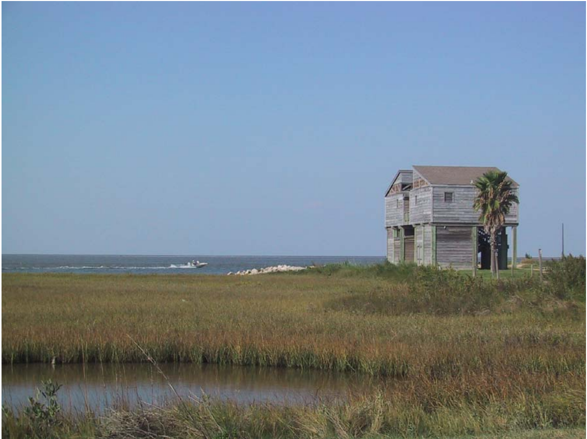
San Luis Pass County Park: Above – Natural habitat has been preserved, as you can see in this picture of the bathhouse. Below – Pictured is a stunning sunset as viewed from the R.V. site.